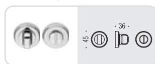
CD 79 BZG 6/8