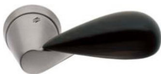
NI/EM Nikelmat/Ebano makassar Matt nickel/Makassar ebony