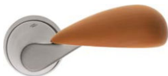
NI/PE Nikelmat/Pero Matt nickel/Pear wood